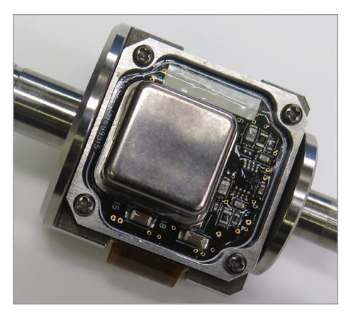
Solid-state MEMS technology means the GyroSphere service can withstand the rigors of drilling operations, including shock and vibration.

The GyroSphere service also has capabilities that enable it to monitor and report its own status, while understanding when to initiate